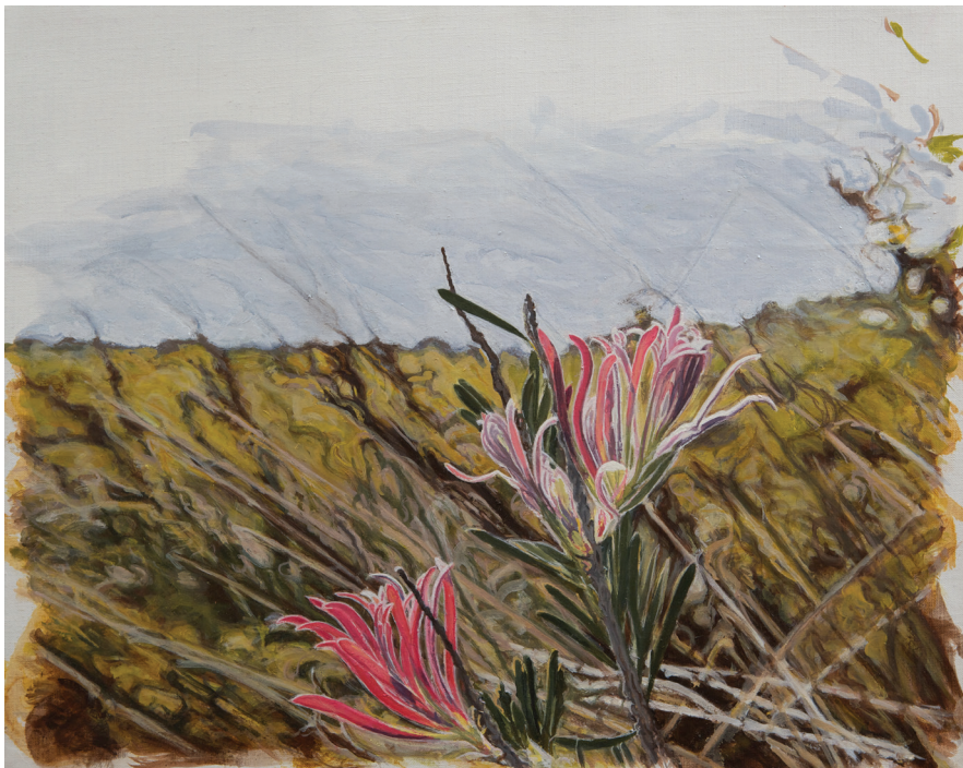
Image: Christine James, Callistemon and Heath Looking East II , 2013, oil on Belgian linen, 40 x 51cm