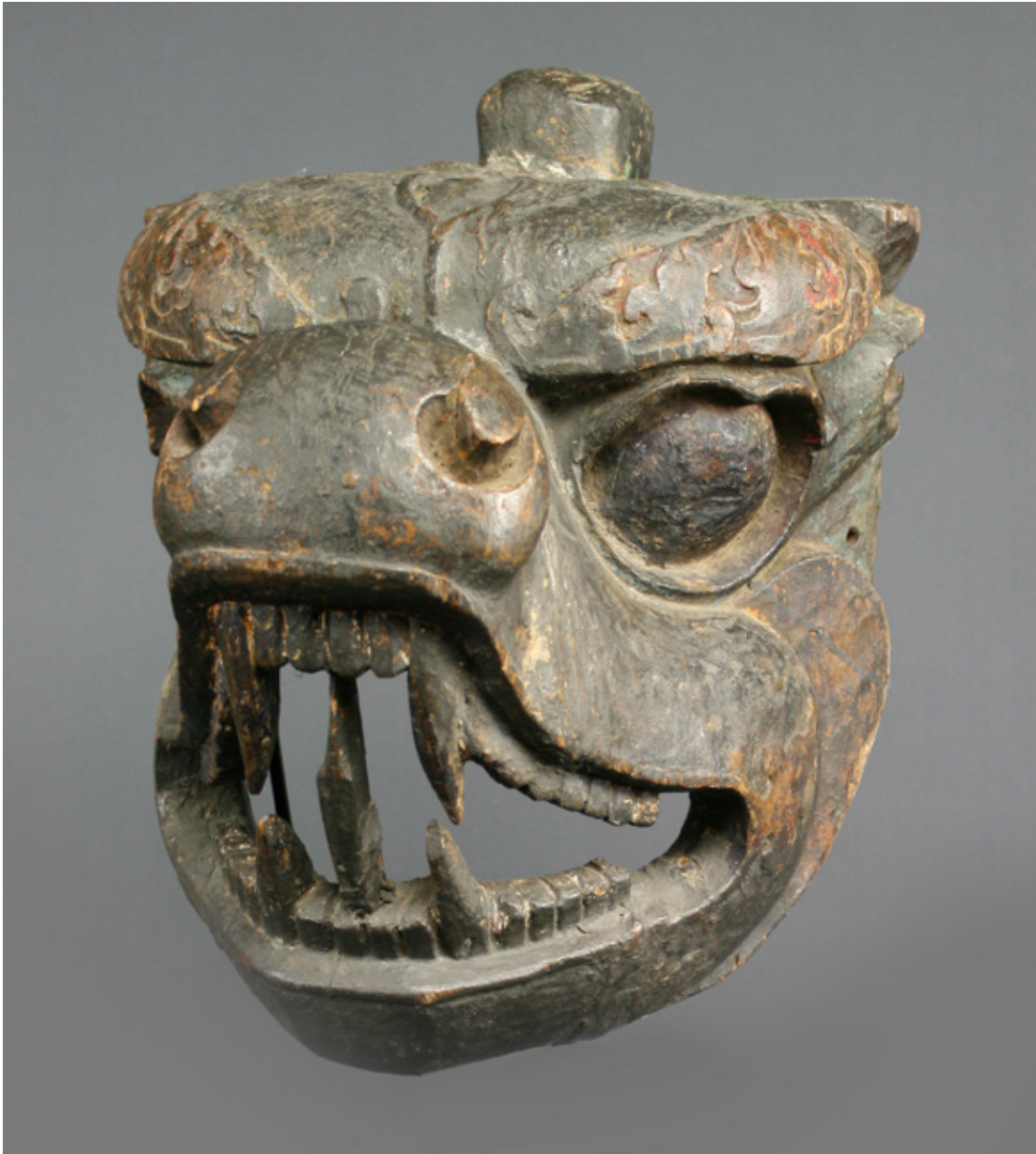
Carved mask c.17th Century Monpa Sherdukpen tribal people, Bhutan timber

This powerful mask is from the Monpa Sherdukpen tribal people who are ethnic Tibetans living in Bhutan and dates from the 17 th Century or earlier. It is of a steppe tiger and bears characteristics from the Tang dynasty in 9 th Century China. There is certainly an interesting possible connection to much earlier masks.