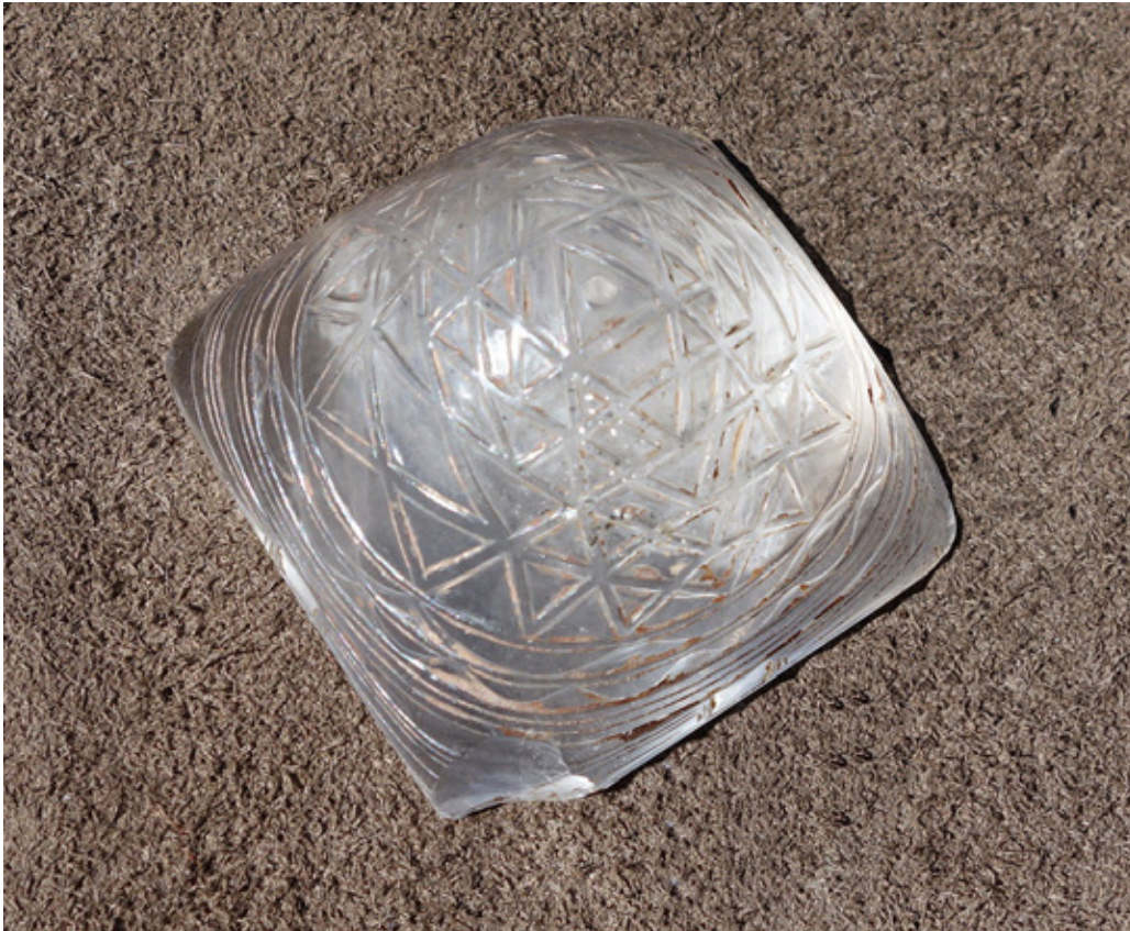
Sri-Yantra, the Universe c.18th Century Nepal rock crystal

The beautiful rock crystal pyramid-form ritual object here is from Nepal is commonly known as a Sri-Yantra, a diagrammatic representation of the mantra, the most sacred and perfect representation of the Universe.