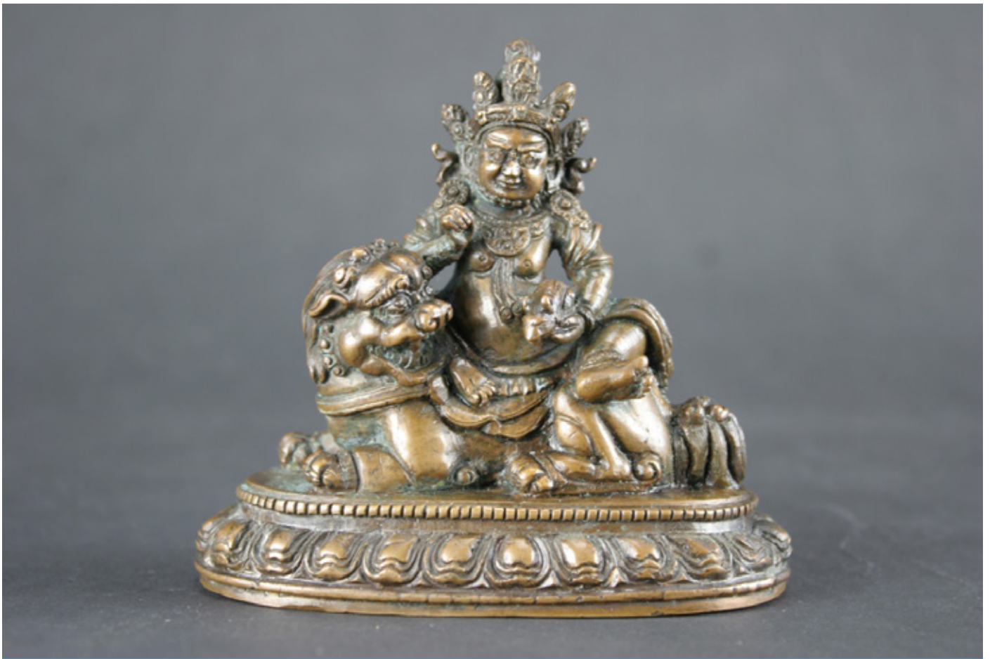
God of Wealth Kubera 1st half of the 19th Century Sino Tibetan bronze

This Sino Tibetan copper alloy bronze represents the God of Wealth Kubera, seated on a lion he holds a rat which is associated and often shown spewing jewels. Not surprisingly this God is identified with acquiring wealth and is prayed to on that account. The figure dates to the first half 19 th Century.