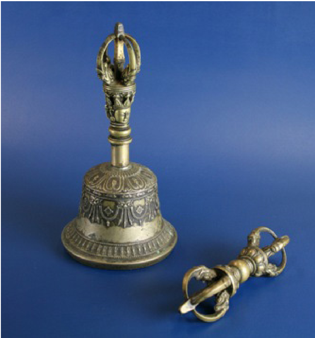
bell and the vajra 15th Century Tibet bronze

The Tibetan bell (Sanskrit: ghanta . Tibetan: dilbu ) and matching vajra (Sanskrit. Tibetan: dorje ) also make use of sound to evoke a change within the subject. The bell resonates finely and for an extended time through the quality achieved in a prescribed alloy of the eight precious metals. The bell is embellished with friezes of vajras. The handle in the form of a vajra surmounts a Boddhisattva head and has a lotus motif in low relief deep in the interior. The bell is rung violently creating a cacophony of sound which is allowed to slowly fade creating an opening for the consciousness to settle into a place of single-focused meditation. Here it is used to create a monotonous sound and melody which act as metaphors for intuitive knowledge and wisdom.