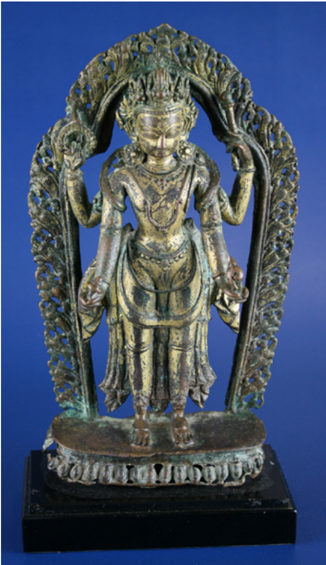
Vishnu c.15th Century Nepal mercury gilded copper bronze

Deity worship as means of personal transformation is somewhat remote from the Western tradition seeming to belong to a world which was easily characterized as heathen by missionaries, the image of the Golden Calf ' Thou shalt not bow down before graven images ... ' In practice it is simply a means of accessing the many attributes of the One God as revealed in the myriad different aspects of the creation. The supplicant seeks to embody aspects of the deity who is relevant to their particular needs at the time.