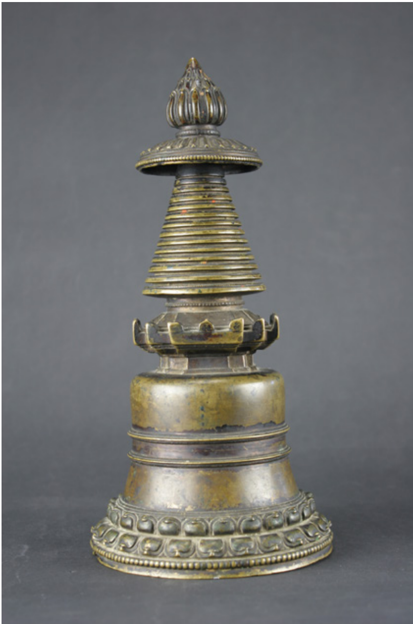
Stupa c.14th Century North East India bronze

The Stupa is the most potent symbol of Buddha's transcendence encapsulating the past, existing in the present and symbolic of Nirvana.