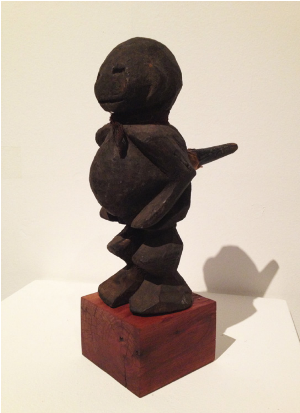
Healing figure from Keaka ethnic group 19th Century Cameroon, West Africa timber

This powerfully carved figure is from the Keaka ethnic group in Cameroon, West Africa. It is a power figure of a type described as being used in healing practices. The tip of horn inserted in the back of the figure is filled with magical charges and sealed with cloth. It is further embellished with a cowrie shell , these were used as currency throughout Africa as they defy counterfeiting. Cameroon, 19th Century.