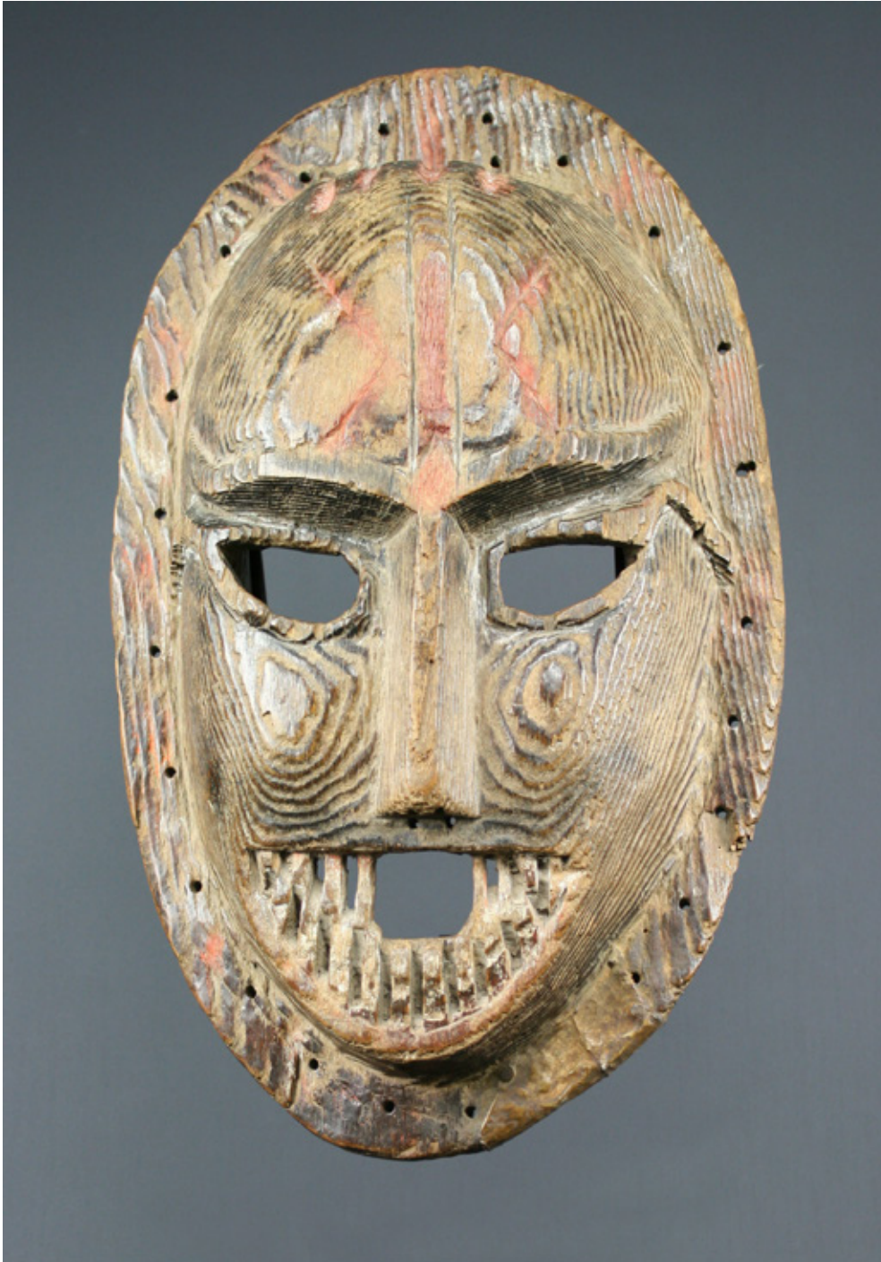
carved mask c.17th Century or earlier Himachal Pradesh, Northern India Himalayan spruce

The finely carved mask from Himachal Pradesh is certainly of an early date, possibly 17 th Century or earlier. It is carved in Himalayan spruce and makes great use of the knots in the wood to accent to cheekbones of the face. The forehead contains the reddish pigmented and incised trident identifying it as being associated with Lord Shiva. It is thought that it was used in dances intended to summon help from the Earth spirits and from Lord Shiva at times of environmental challenge, floods, droughts of other challenges to agriculture.