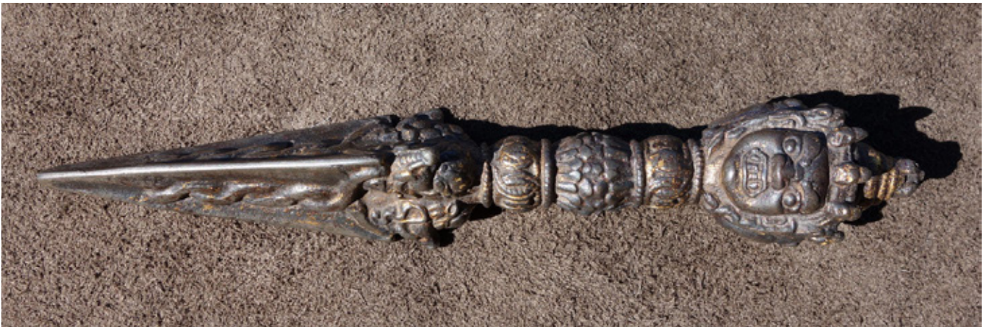
Kila, ritual dagger c.15th century Tibet meteorite iron

This triangular bladed ritual dagger (Sanskrit: kila . Tibetan: phur ba ) is from Tibet and dates from the 15 th Century. Daggers of this type are typically made of either rock crystal (very rare), brass, wood or iron. In this example the central part of the handle is in the form of an endless knot symbolizing the eternal nature of the Universe and with three heads of protective monsters mukharas .