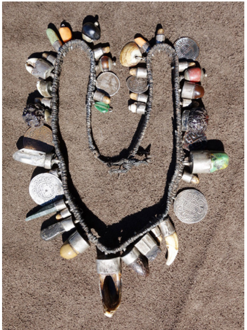
image right: Nepalese necklace c.19 th Century Nepal tiger's claw, coins, crystals, shells

The Nepalese necklace included above incorporates as many power objects as possible and is of a type used in Nepal to protect infant children. Placed around the head of the infant the necklace is expected to act as a talisman to protect the infant from choking as it ingests its first solid food. The viewer can determine the source of many of the attachments which include a tiger's claw at the bottom, various coins and crystals as well as cowrie and other shells which of course are tremendously rare in the Himalayas.