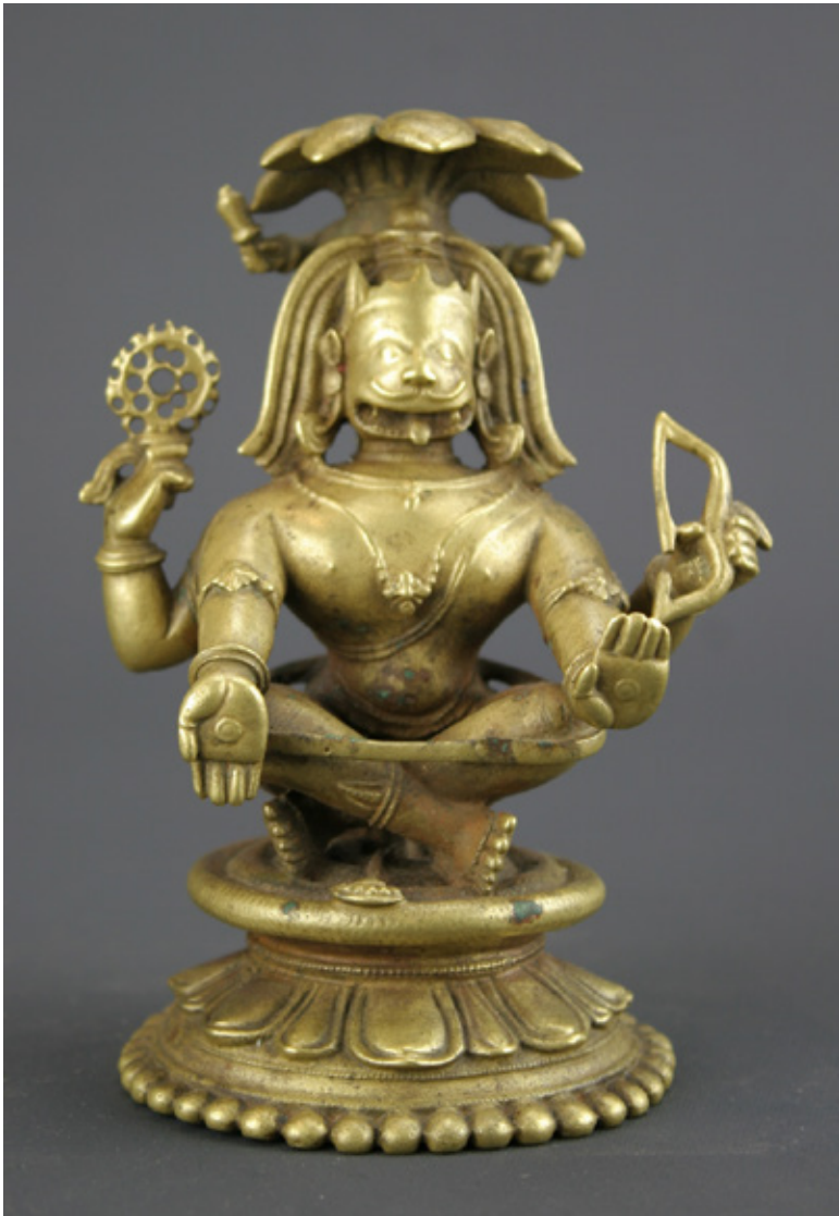
Vishnu, Narasimha Lion: The Great Protector c.15th Century Orissa, India bronze

The seated lion-headed figure is from Orissa and also dates from the 15 th Century, although it is not readily apparent this is another manifestation of Vishnu called Narasimha. This avatar of Vishnu is worshipped in order to access the qualities of literally becoming lion-hearted, he is accordingly one of the most popular avatars and is known primarily as the “Great Protector” who specifically defends and protects his devotees in times of need.