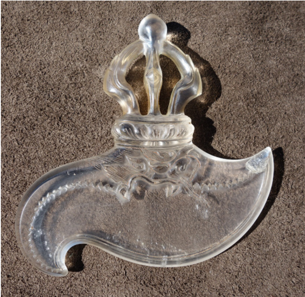
gri-gugin , Tibetan ritual flaying knife 17th/18th Century Tibet rock crystal

This rock crystal object is a Tibetan ritual flaying knife (Sanskrit: kartri . Tibetan: gri-gugin ) used in its metal form as a practical implement it is the tool used for dismembering bodies of the deceased in the Tibetan form of body disposal whereby the fleshy parts of the body are fed to vultures and other birds of prey.