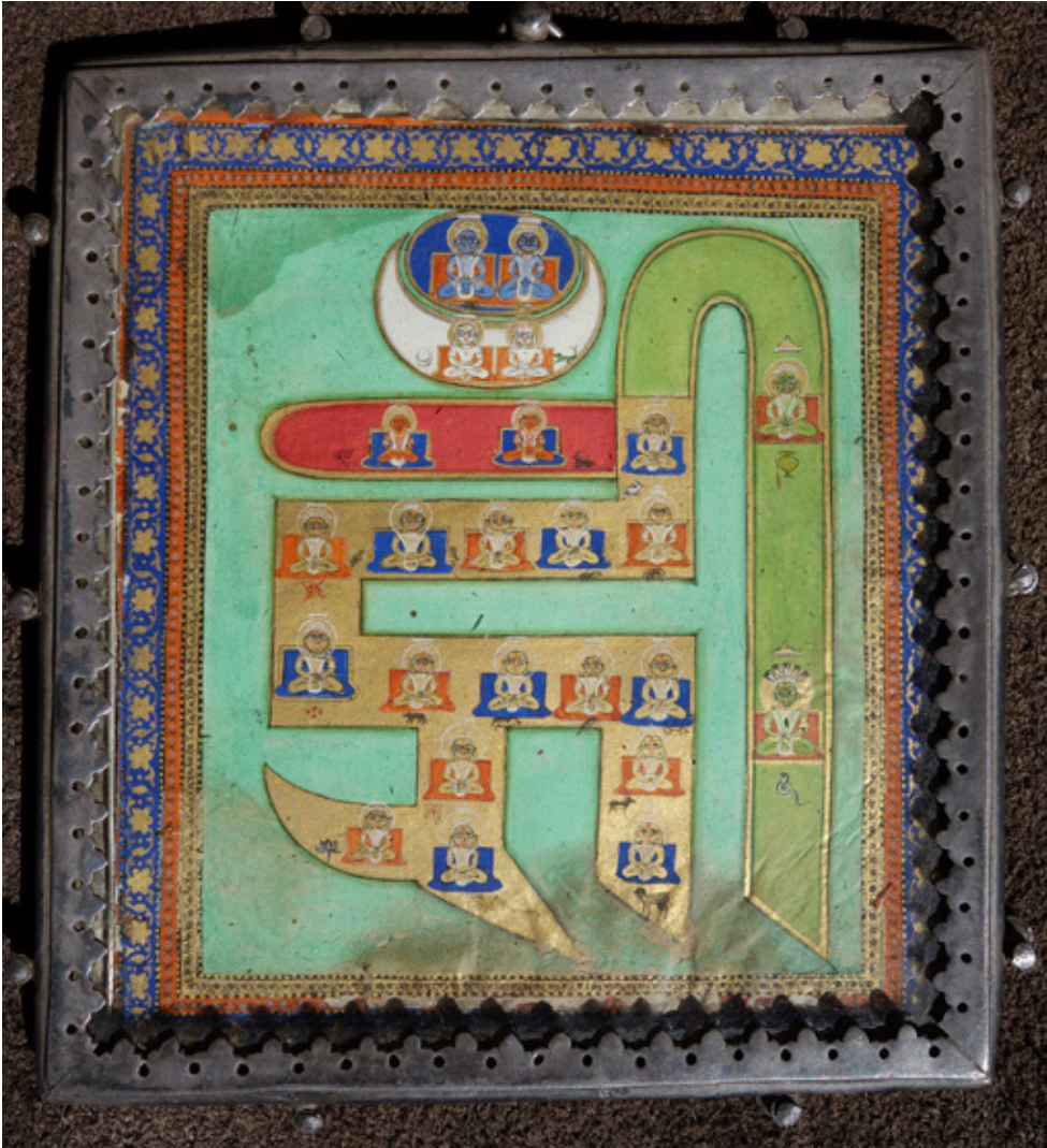
Jain Devotional Shrine c.18th Century Northern India