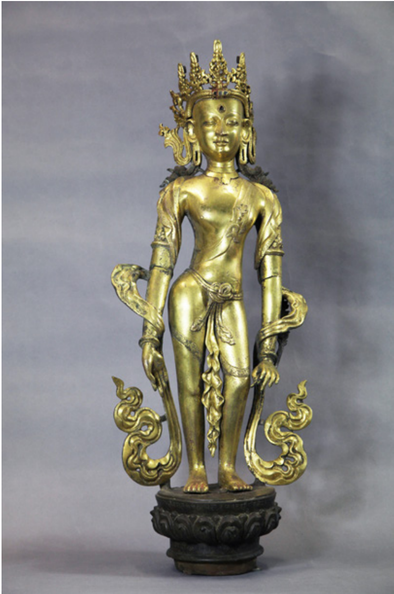
Avalokitesvara c.18th Century Nepal gilded bronze

Avalokiteśvara is known throughout the Buddhist world in many different names and a vast array of different manifestations as well as being both male and female. He is the Bodhisattva of compassion and is called upon to safeguard humanity. The notion of the Bodhisattva itself is one of great compassion for it is the term applied to a soul who through great merit has escaped the fate of being reborn into this world but who has foregone that great goal by accepting rebirth in order to assist others in their strivings for escape from rebirth. This also embodied risk for there is always the possibility of again becoming ensnared by Maya illusion, which would entail further reincarnation in this, the realm of suffering. In Sanskrit Avalokiteśvara is also referred to as Padmapani (Holder of the Lotus) or Lovesvara (Lord of the World). In Tibetan, Avalokiteśvara is known as Chenrezig and is said to be incarnated as the Dalai Lama, the Karmapa and other high lamas.