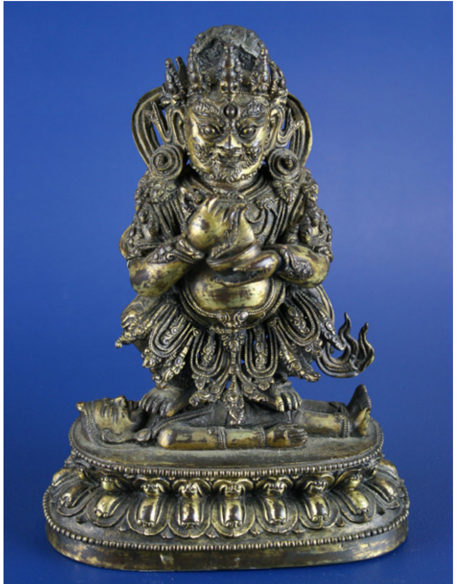
Mahākāla (Dharmapala) protector of dharma c.15th Century Sino-Tibetan bronze

This fearsome and intense bronze is Sino-Tibetan and dates from the 15th Century. Mahākāla (Sanskrit) is a Dharmapala, a protector of dharma. Mahākāla is relied upon in all schools of Tibetan Buddhism. He is depicted in a number of variations, each with distinctly different qualities and aspects. He is also regarded as the emanation of different beings in different cases, namely Avalokiteśvara. Mahākāla is typically black in color. Just as all colors are absorbed and dissolved into black, all names and forms are said to melt into those of Mahākāla, symbolizing his all-embracing, comprehensive nature. Black can also represent the total absence of color, and again in this case it signifies the nature of Mahākāla as ultimate or absolute reality. This principle is known in Sanskrit as “nirguna”, beyond all quality and form, and it is typified by both interpretations.