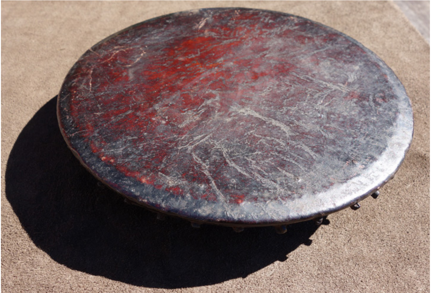
Shamans Hand Drum c.19th Century Nepal timber and animal skin