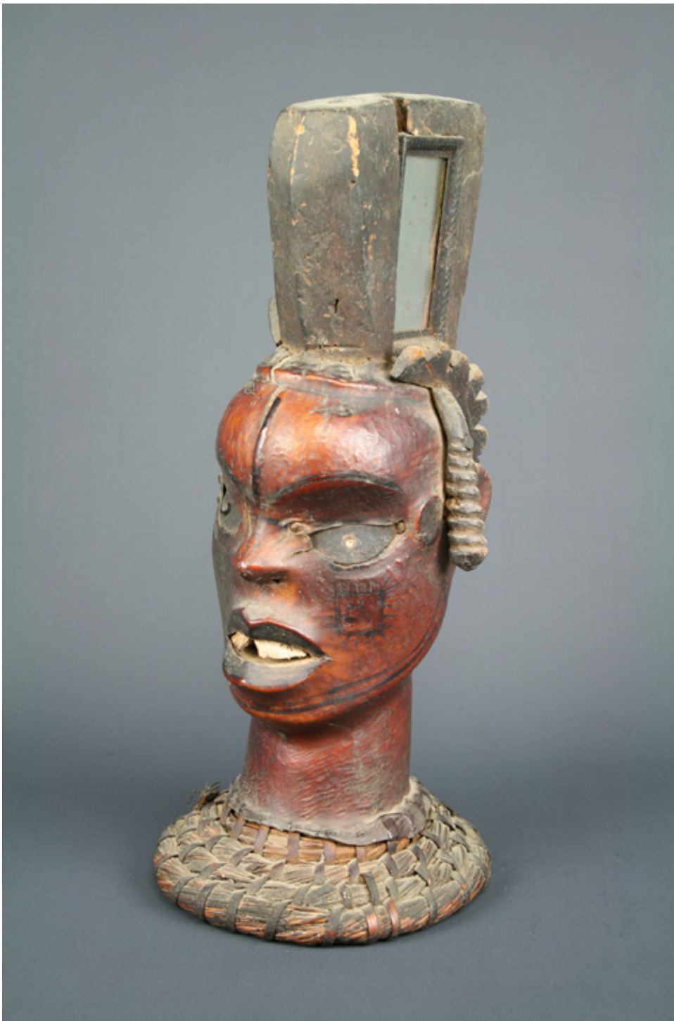
Ancestral Spirit 19th Century Cameroon, West Africa timber, antelope skin

This striking skin-covered wood head is from the Ejagham tribe in southeast of Nigeria and extending eastward into Northern Cameroon and belongs to the Ekoi-speaking peoples. This group is renowned for the heads and skin-covered helmet-masks which are unique in Africa. Earlier skins of slaves, later skins of antelopes, were used.