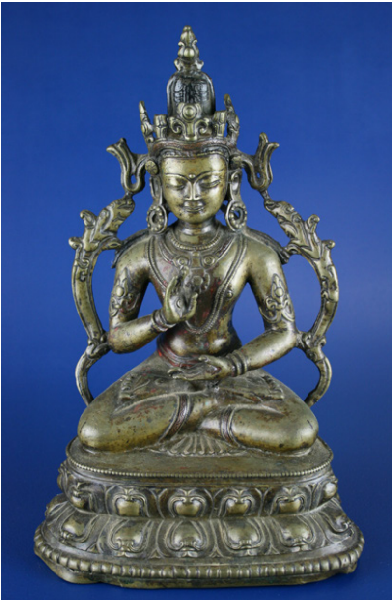
Amoghasisshi c.14th Century Western Tibet bronze

Amoghasisshi is one of the five Tathagatas which are emanations of the Absolute as it is divided into a five-part system. These five parts represent the fine and the coarse components of the Universal system. Each Tathagata fills a specific role in the organizational structure of the manifest world and plays a central role in the esoteric and secretive teachings of Tibetan Buddhism.