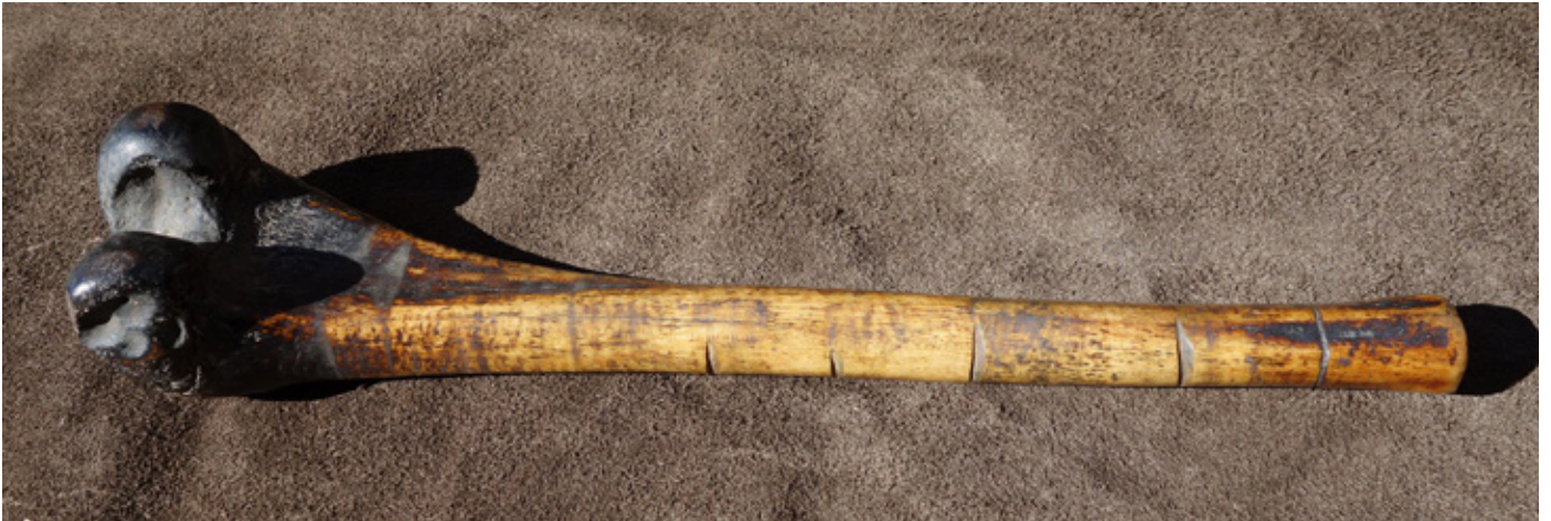
Tibetan kangling Tibet bone

The human thighbone trumpet (Tibetan kangling ) produces an eerie wailing sound used in the Tibetan ceremony known as Chöd . As in Western culture, objects derived from the human body were held in awe and reserved for use in intensely magical ceremonies. They derive from a crucible of instruments from Tantric India and first appeared in the 9 th Century. This ancient example appears to date from an early period judging from the rich dark patina.