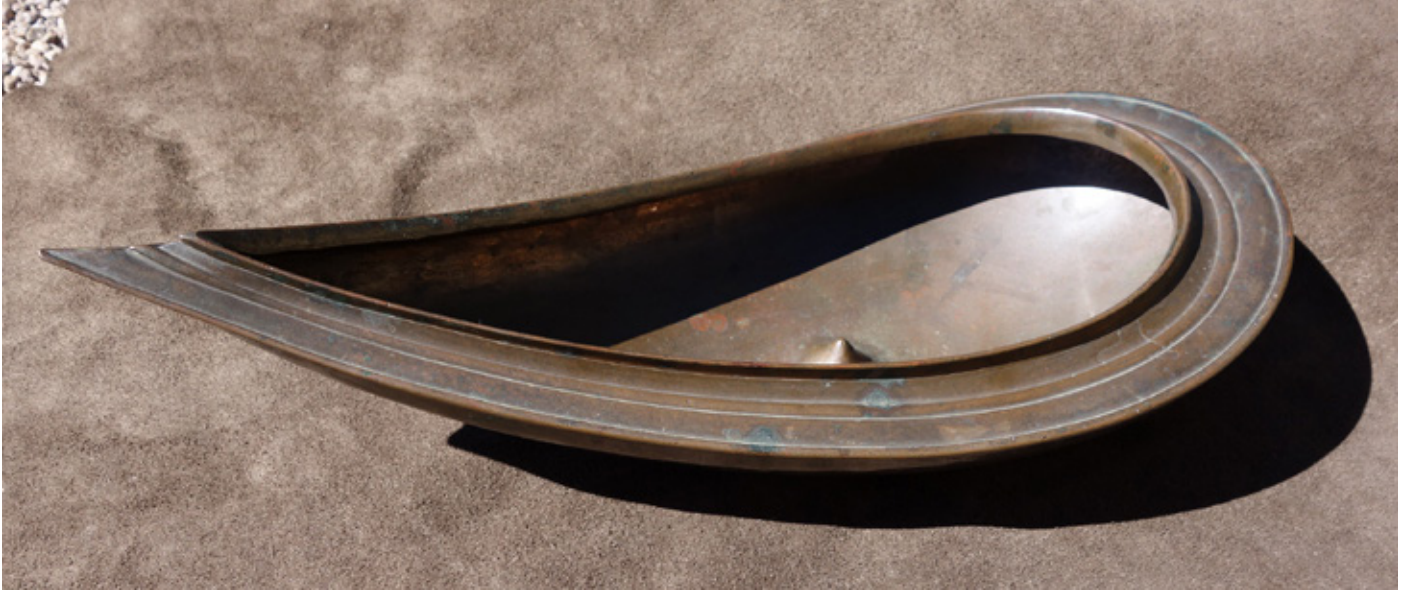
Libation Cup 18th Century Tibet copper

The finely formed copper vessel is a Libation Cup used to contain holy-water. It is most probably from Bengal and is shaped in the form of a yonī , a cosmic symbol representing the female sexual organ. It is 18 th Century in date. This vessel is known as an argha patra , which is filled with water and held in the hand during a purification puja during which the water is poured over the deity to bathe the deity devatā . This is carried out as an act of worship and thus to accrue the benefit of this act. An image in a Pahari miniature shows Parasumara offering a libation of blood using the same for of vessel.