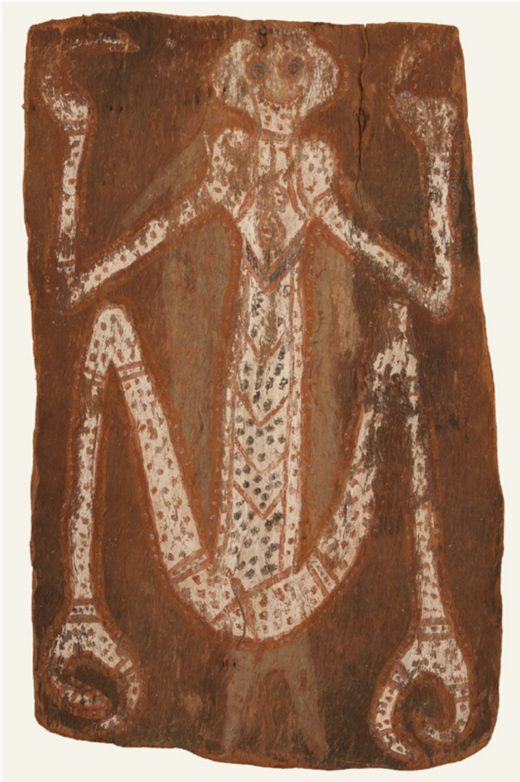
image right: Namarrkon (the Lightning God) c.1940 Kakadu, Northern Territory natural earth pigments on bark

The early bark painting shown here is of Namarrkon (the Lightning God) and comes from the Kakadu region. It is painted over an earlier image of a fish. Namarrkon is the God who dispenses justice in the form of lightning strikes on those who have drawn his ire. The stoe country from where this painting comes is hugely active with many hundreds of lightning strikes per hour occurring when the hot rocks of the country generate static electricity in the moisture laden air of the build-up to the wet season.