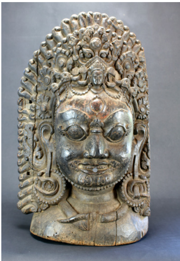
Bhairava (Lord Shiva) c.17th/18th Century Nepal timber

Bhairava (Sanskrit: sometimes known as Kaala Bhairava , Kal Bhairab , Annadhaani Bhairava ) is the fierce manifestation of Lord Shiva associated with annihilation. He is one of the most important deities of Rajasthan, Tamil Nadu and Nepal who originated in Hindu mythology and is sacred to Hindus, Buddhists and Jains alike.