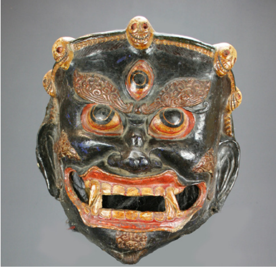
Mahakala mask c.18th Century Tibet composite materials: resin, fabric, polychrome

In this section of the works from the collection there is greater diversity of cultures and ethnicities than in the previous sections. The theme contained here is one of accessing Universal energy through a variety of means including dance; potent magically imbued objects which are charged with special powers in the mind of the believer; the accoutrements of the shaman including masks worn to evoke a particular energy or deity.