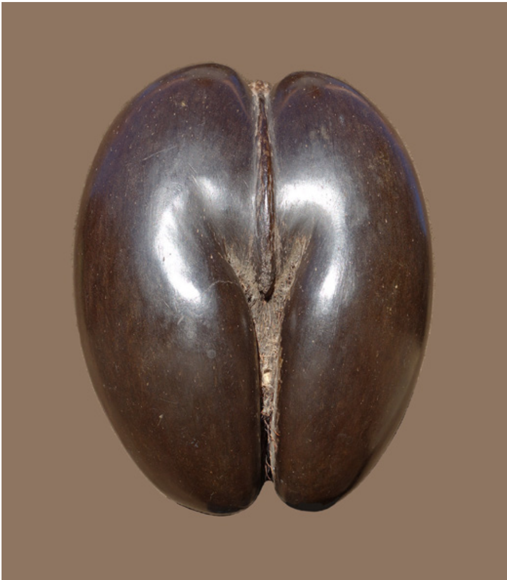
Coco-de-mer Southern India coconut shell

The coco-de-mer is one of the most beautiful representations of the yonī , the human female vulva. It is found exclusively in the Seychelle Islands and examples such as this derive from the shores of Southern India where they have been washed ashore. The original form would have been rough and textured, this example is centuries old and has been paired back and polished to accentuate the human female form. 'The whole womb-complex was often symbolized by signs referring to the outer appearance of the human vulva, as in numerous emblems and objects from the European palaeolithic caves. Indian Tantra preserves this symbolism, alongside its own anthropomorphic images of the Goddess. The Tantrika who makes puja to one of the many small items of the female vulva (called yoni) is making it to that all-embracing creative energy for which the yoni is the symbol.' Rawson p.54