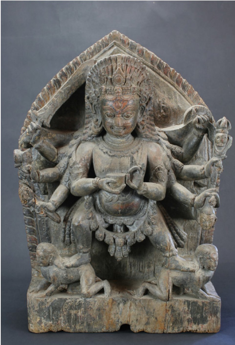
Mahākāla called Nyingshuk c.17th/18th Century Nepal timber

This wood figure of Mahākāla is six-armed version of Mahākāla called Nyingshuk the name of which came from Khyungpo Naljor, the founder of the Shangpa Kagyu. The sculpture is in a dancing posture, rather than standing straight up, and is a very advanced Mahākāla practice.