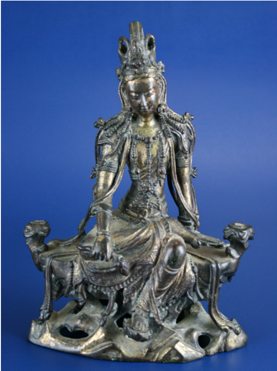
Guan Yin c.12th Century China gilt bronze

This very fine Yuan or Early Ming Gilt Bronze is the Chinese equivalent of the Avalokiteśvara named Guan Yin in Chinese it dates from the 12 th Century. It is notable in the great finesse and accuracy of the casting of the double-lotus figure (flowers now missing) seated on an openwork structure representing clouds, this would have come from a wealthy private shrine or temple.