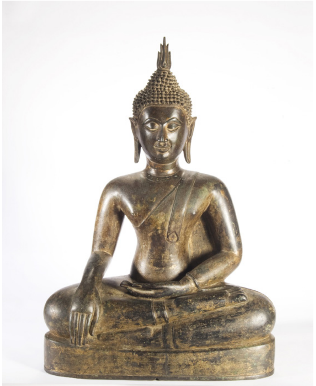
Buddha 16th Century Thailand bronze

The Buddha wears an unadorned monk's robe, folded across the left shoulder. His right hand extends to the ground in the earth-touching gesture ( bhumisparsha mudra ), signifying the Buddha calling on the earth to witness his attainment of enlightenment. His legs are crossed, with only the sole of the right foot visible. With a serene facial expression, the Buddha is shown with the pronounced cranial bump, capped with a flame-like jewel, characteristic of Thai Buddhist art. For Theravada Buddhists, this type of image serves as a focus for contemplation of the dharma , or Buddha's teachings.