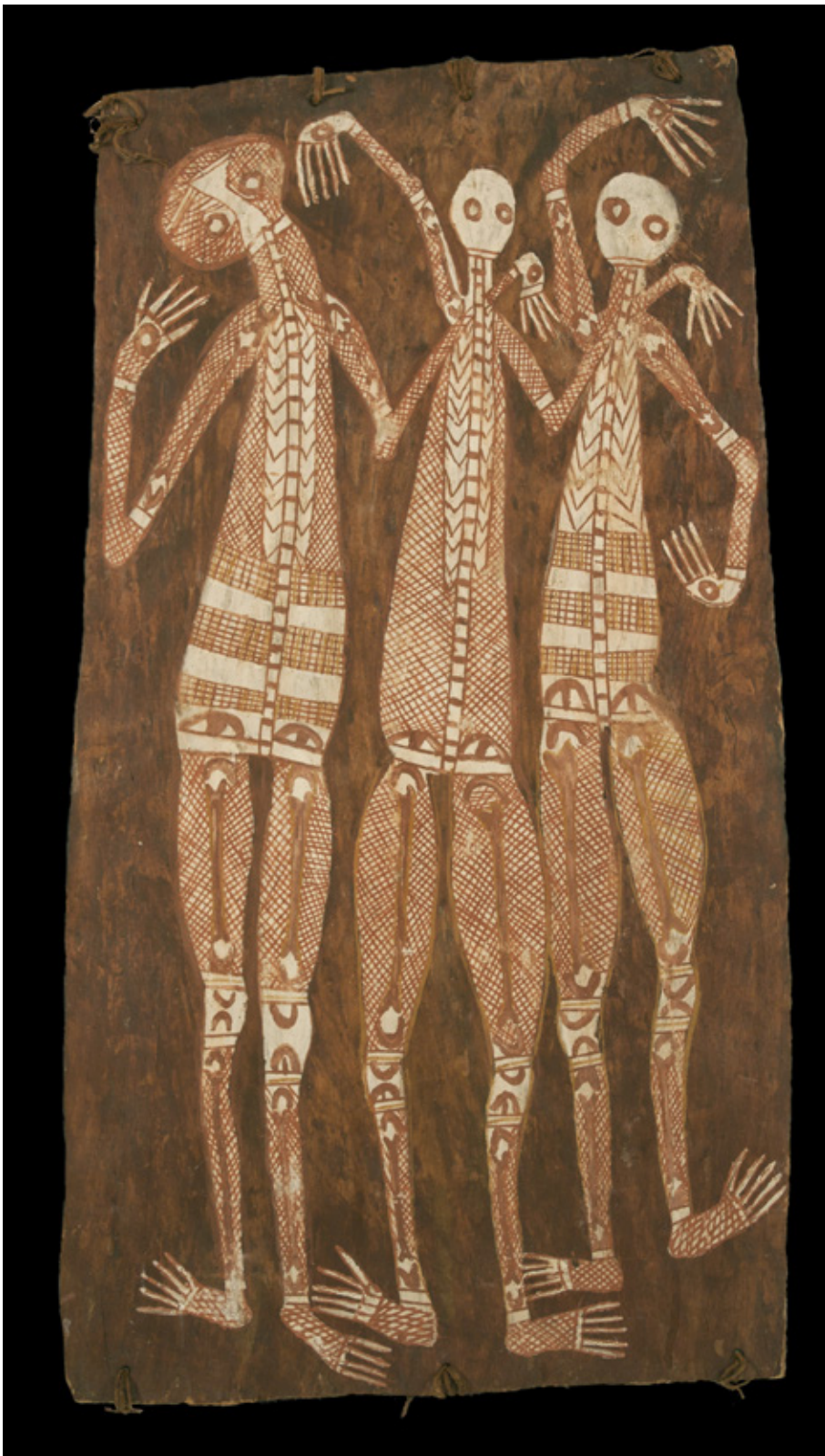
image left: Yirawala c.1897-1976 Lorrkon (log coffin) ceremony c.1950s Marugulidban, Arnhem Land, Northern Territory natural earth pigments on bark

Yirawala (1903-1976) is considered by many to be the finest bark painting artist. His work was known to modern European artists, and Picasso commented on the finesse and quality of his work stating that he was envious of his (Yirawala's) ability.