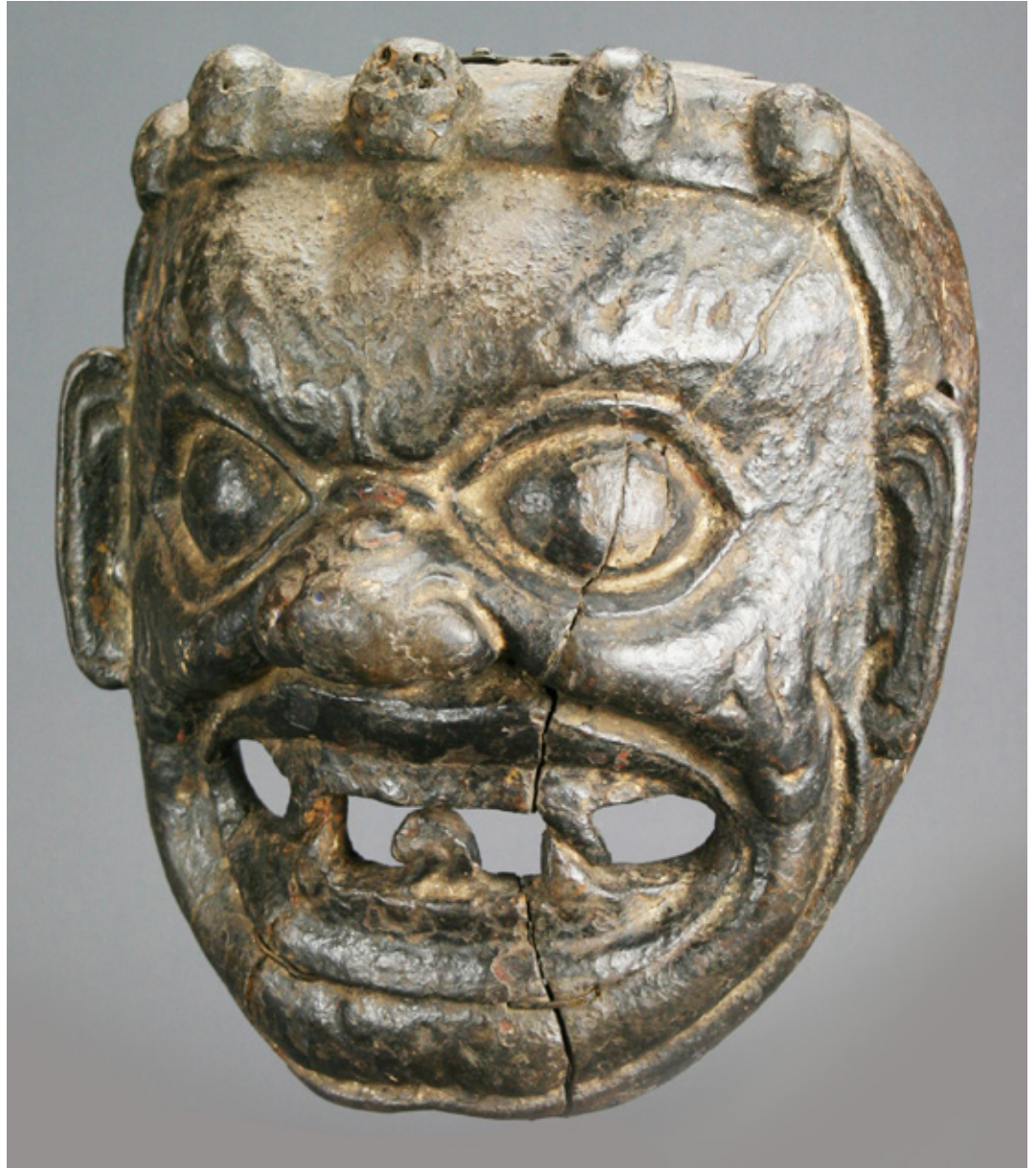
Khroda deity Mahakala c.16th Century Bhutan timber

I am including another fine and early example of a mask of Mahakala, this one is from Bhutan and is among the finest and earliest masks I have encountered from this region.