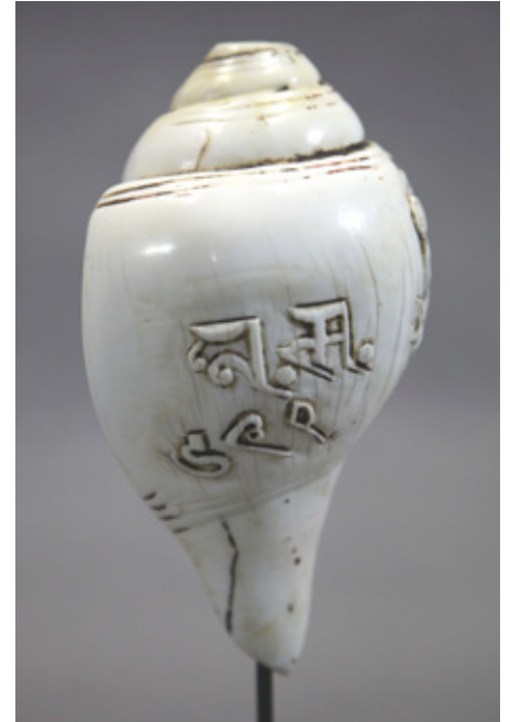
Nepalese conch shell trumpet 1771 Tibet conch shell

Sound, the primordial gesture as understood within the Vedas, the ancient Indian Hindu texts extending back more than 5,000 years where the AUM (OM) sound gave rise to both light and matter. Among the works included here are a Nepalese conch shell trumpet which was intended to invoke the deity. The conch is carved in low relief with a finely detailed figure of Vishnu riding his mount Garuda and a standing Bodhisattva. Dated dated Sambat 891 (1771 AD), the conch is one of the attributes of Visnu and represents the Dharma or Universal Law which is ubiquitous, the character of sound is that it penetrates every tiny nook, every fissure and is inescapable as is the Dharma.