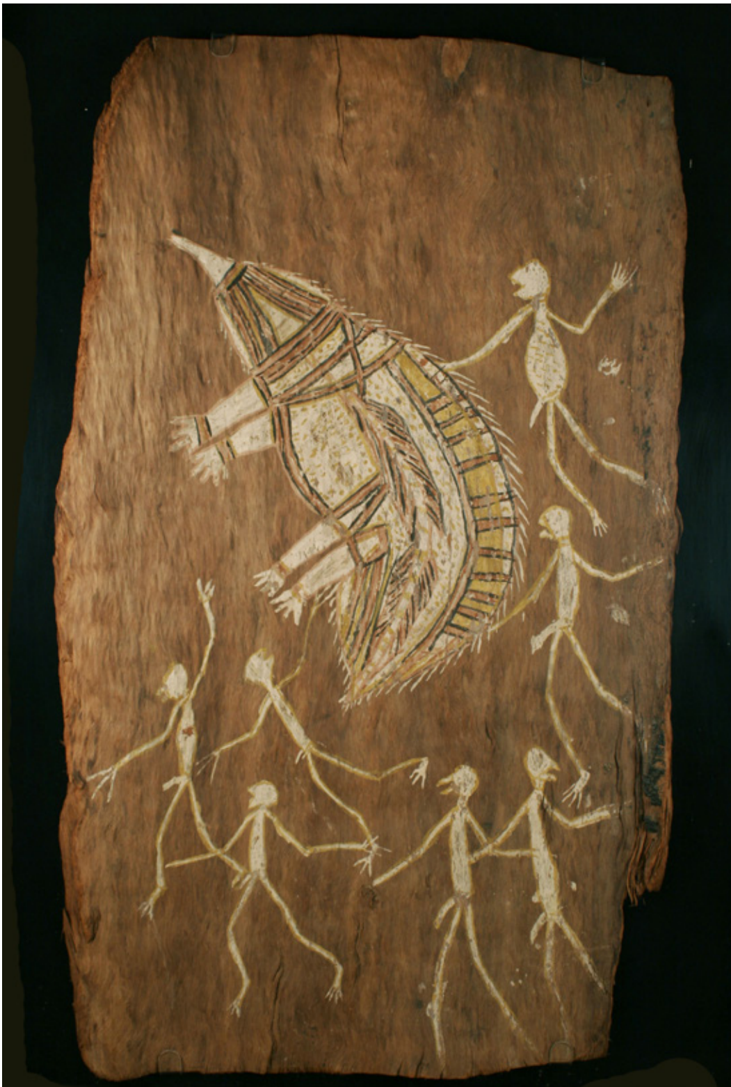
echidna hunt c.1950s North West Arnhem Land, Northern Territory natural earth pigments on bark

This bark painting is of an early date as evidenced by the remnant spinifex gum along some of the edges indicating it had been used inside a bark shelter as were constructed to provide shelter during the wet season. It is an echidna hunt and would have represented an “increase” ceremony directed towards successfully sourcing echidnas as a food source.