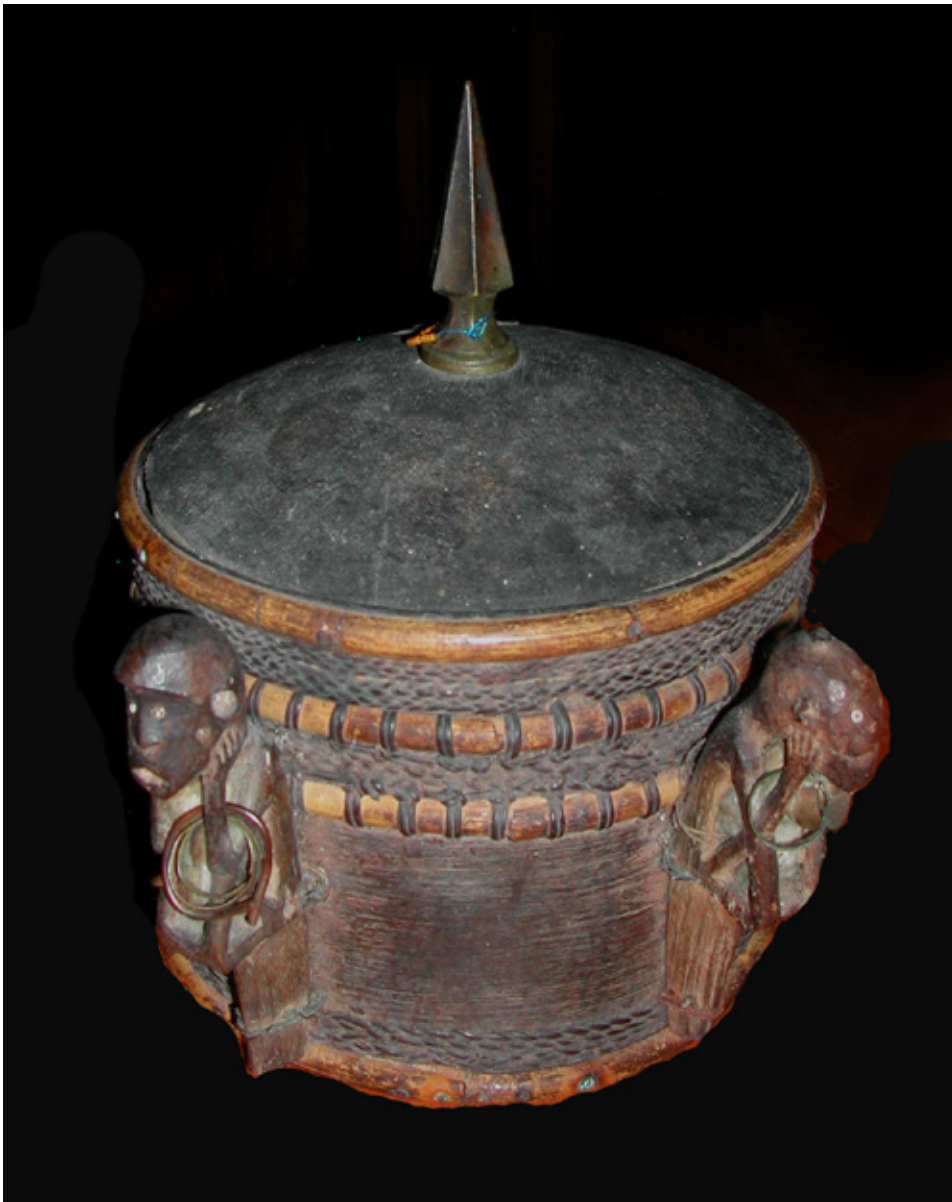
Dyak shaman's box c.19th Century Kilmarta, India

This Dyak shaman's box contains a haunting array of power objects employed by the shaman in accessing the spirit world. The two figures attached to the front are each "charged" with magic materials inserted between their limbs against their chests.