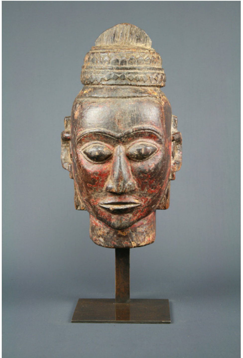
Guari, Goddess of Power, Creation and Victory of Good over Evil 19th Century Kerala in southern India timber

This powerfully carved wood head from Kerala in southern India represents Guari, Goddess of Power, Creation and Victory of Good over Evil. She is known by 108 names from the Durga Saptashati, as such she is a manifestation of Parvati, consort of the of Lord Shiva, and is known as the motherly form of Mother Goddess Gauri Jagadamba, Parvati is another form of Shakti, the wife of Shiva and the gentle aspect of Maha Devi, the Great Goddess. 19th Century.