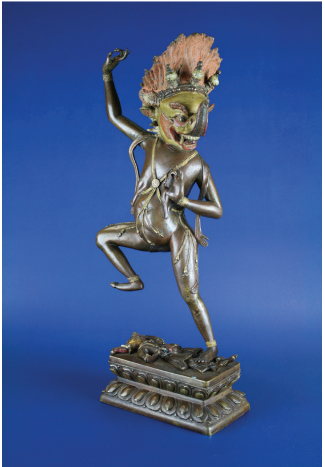
image left: Figure of a Jain Gina 9th/10th Century Southern India bronze