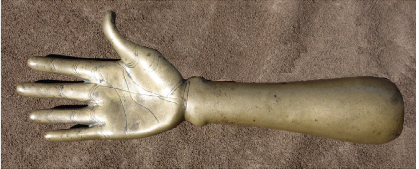
Sati, Devotional object c.18th Century India bronze

This amazing and unsettling object is a Hindu sati arm, representing the most potent form of voluntary transformation, that of an elected death. The practice of sati or self-immolation of a wife following the death of her husband evolved from the legend of Shiva and his first wife Sati. By the Mughal period the practice had become embedded across much of India and amongst a broader social range.