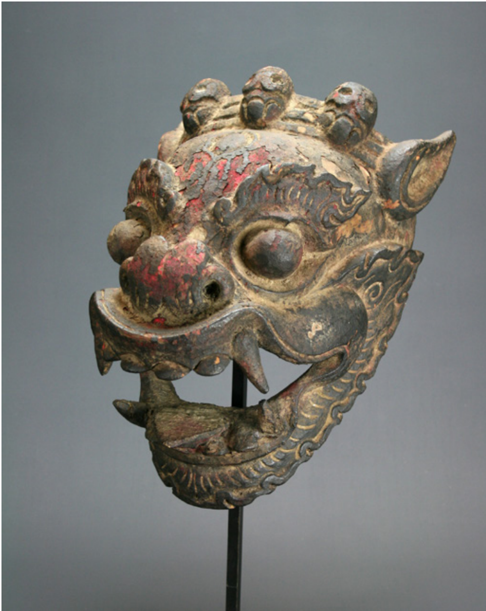
Snow lion 19th Century Himalayan timber

The second example of a Himalayan feline mask is this powerful Bhutanese mask representing a snow lion, painted and incorporating Buddhist motifs in the form of the skull citipati heads across the top it clearly evokes the spirit world.