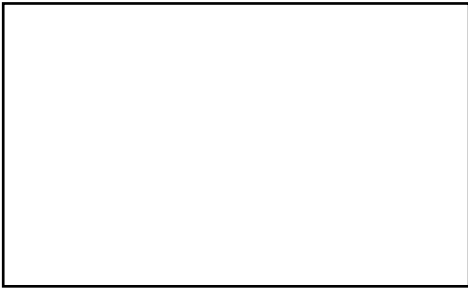
Bethany Hough The webs that connect me to you 2013 90 x 70 cm watercolour and ink on paper

Thinking of your family and culture, draw your own webs and lines of connections in the space below.