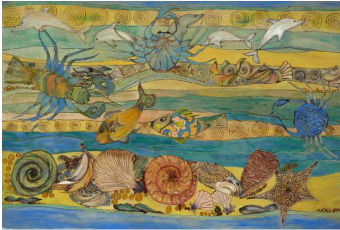
Cecily Wellington-Carpenter My Country: Shoalhaven 74 x 104 cm acrylic paint and wood-burning on wood

Find Cecily Wellington-Carpenter’s work My Country: Shoalhaven .